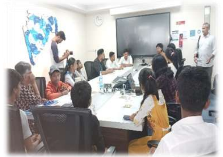
Meeting on Climate Change - UNICEF