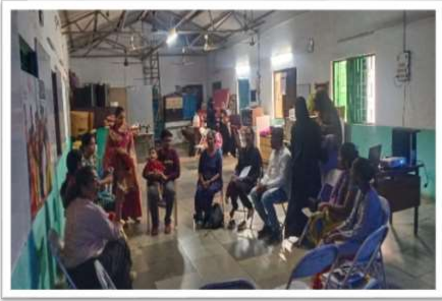
STAFF TRAINING: Pragati App