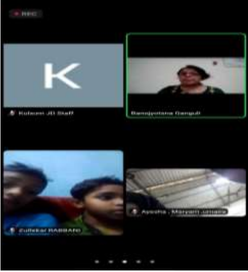
Digital Learning Class